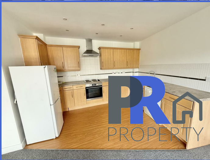
23 Foxglove Way, Luton, Bedfordshire, LU3 1EA Offers in excess of £180,000